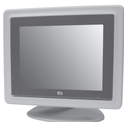
▲ Desktop stand